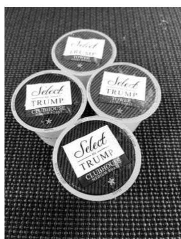
This week's 2nd prize: The best coffee that was ever made ever.

THE STYLE CONVERSATIONAL The Empress's weekly online column discusses each new contest and set of results. Especially if you plan to enter, check it out at wapo.st/styleconv .